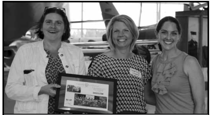
Buel Elementary School

State report cards for each school and the district for the 2012-13 school year are on the district website: https://msd.orvsd.org//StateReportCards .