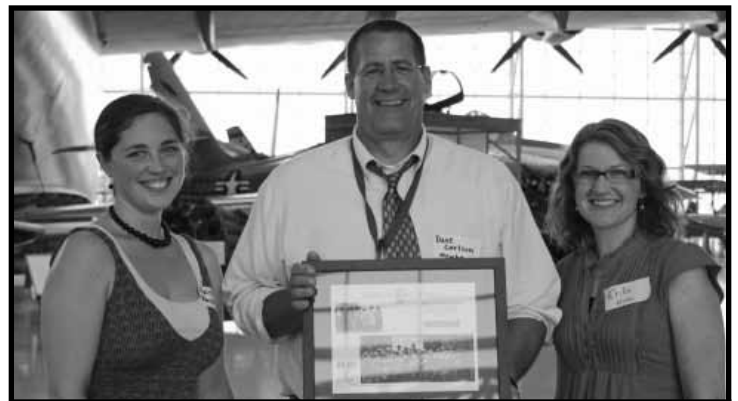
Newby Elementary School