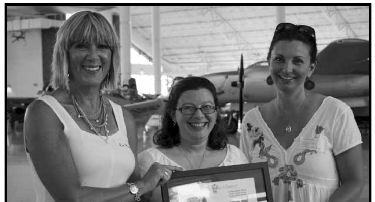
Duniway Middle School