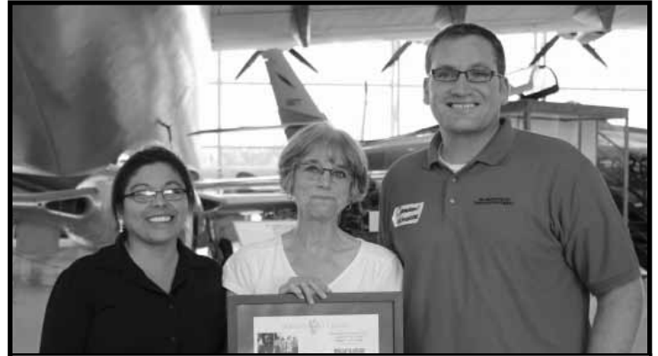
Memorial Elementary School